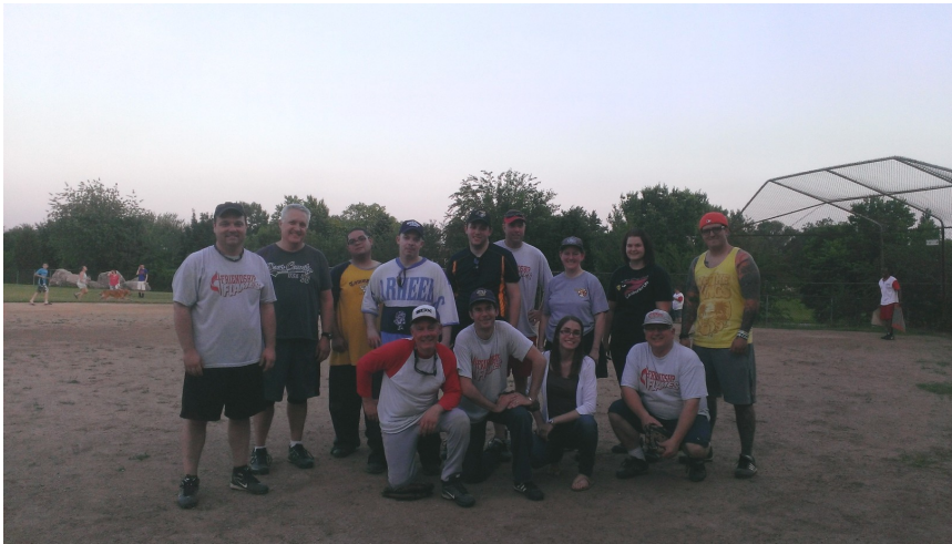
Last chance to catch a game this season!