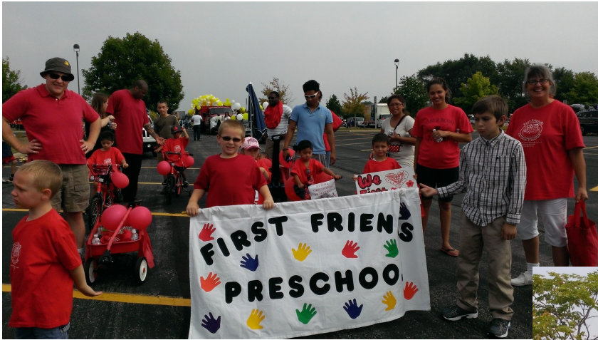
First Friends Preschool was well represented!