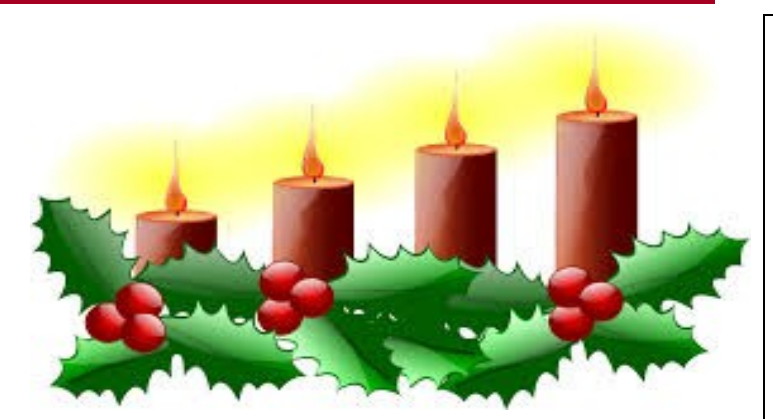
Advent Festival for All Sunday, December 1, 2013 4:30 PM – 6:30 PM

Ready or not, Christmas is coming! Join us for devotion, drama, chili, and fellowship.