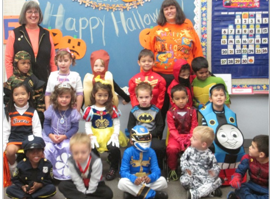
Monday, Wednesday, Friday Class

We dressed up for Halloween, we sang songs for our parents, had a special snack, and went trick-or-treating in the hallway.