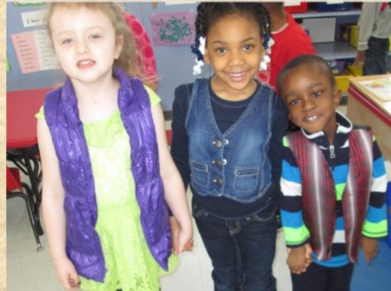
V for Vest