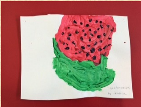
W for Watermelon