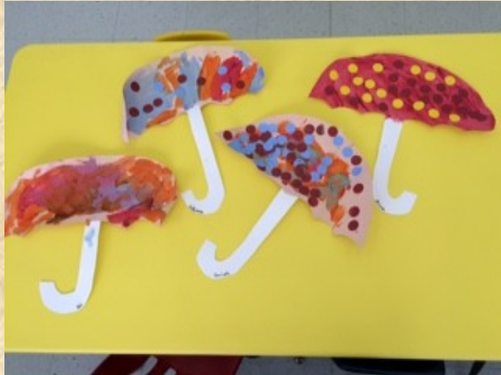
U for Umbrella