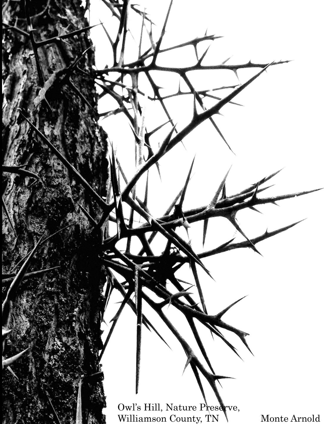
Owl's Hill, Nature Preserve, Williamson County, TN