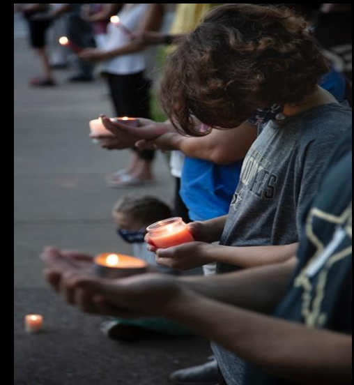
George Floyd Prayer Vigil Belmont United Methodist Church Jerry Park