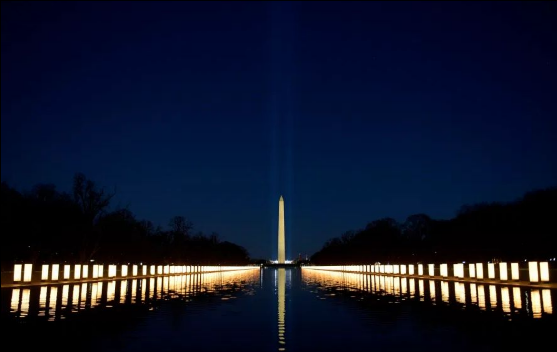
Memorial for persons who have passed away from Covid.