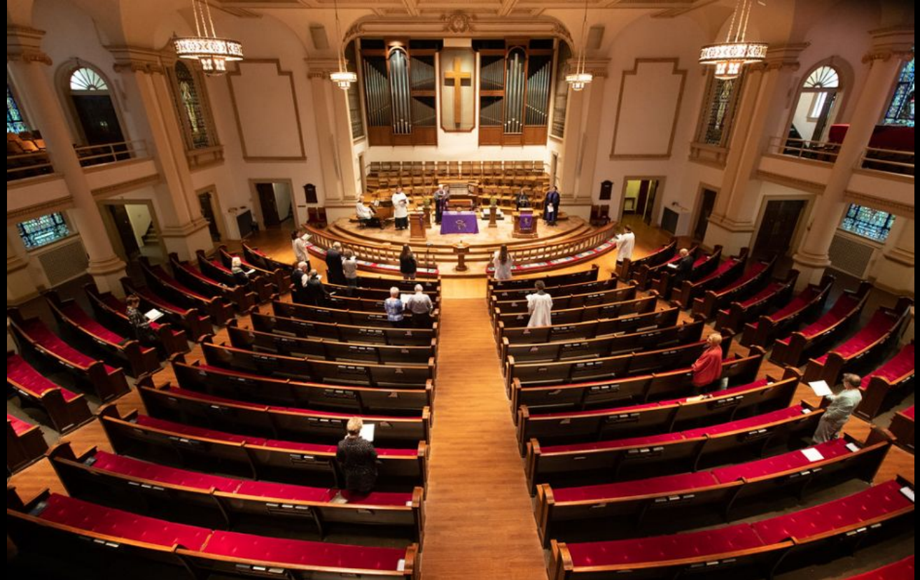
Members and leaders of Belmont United Methodist Church in Nashville, Tenn., worship in a mostly empty sanctuary while the congregation worships remotely.